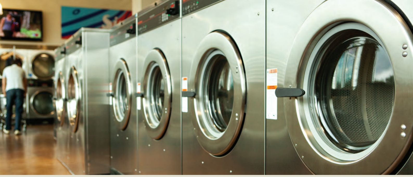
ACTIVATIONS SINGLE DROP • DUAL DROP • ELECTRONIC DROP • AFTERMARKET CARD READERS AND CENTRAL PAY Available in 9.0 kg (20 lb), 13.6 kg (30 lb), 18.0 kg (40 lb), 27.0 kg (60 lb) and 36.3 kg (80 lb) capacities.