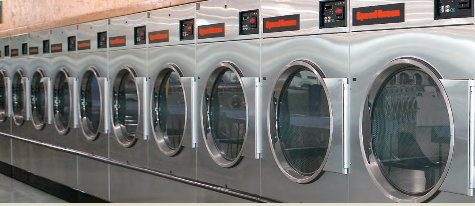
ACTIVATIONS SINGLE DROP • DUAL DROP • ELECTRONIC DROP • AFTERMARKET CARD READERS AND CENTRAL PAY

Available in 11.3 kg (25 lb), 13.6 kg (30 lb), 15.9 kg (35 lb), 23 kg (50 lb), 24.8 kg (55 lb) and 34.0 kg (75 lb) capacities.