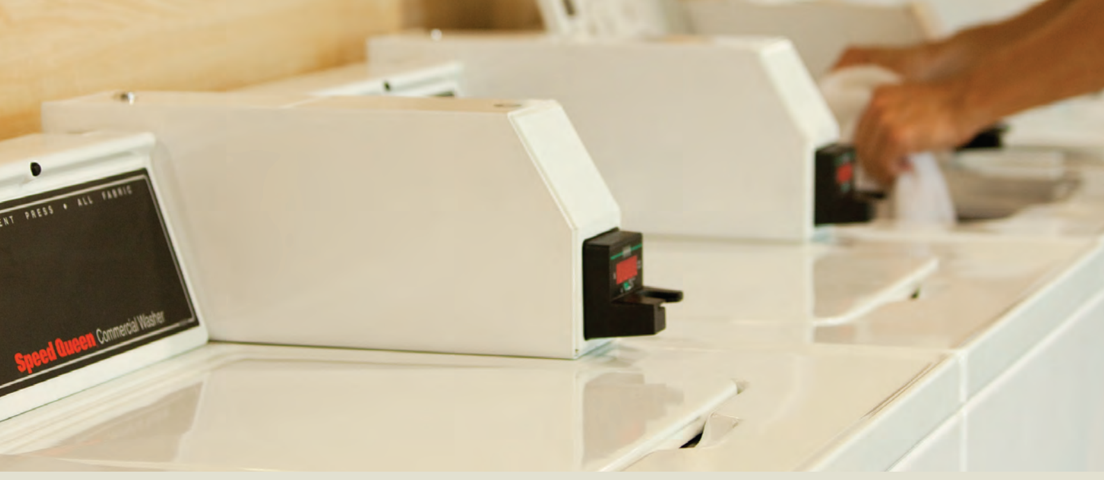
ACTIVATIONS SINGLE DROP • DUAL DROP • ELECTRONIC DROP • AFTERMARKET CARD READERS AND CENTRAL PAY • COIN SLIDE Available in 7.3 kg (16 lb) capacity.