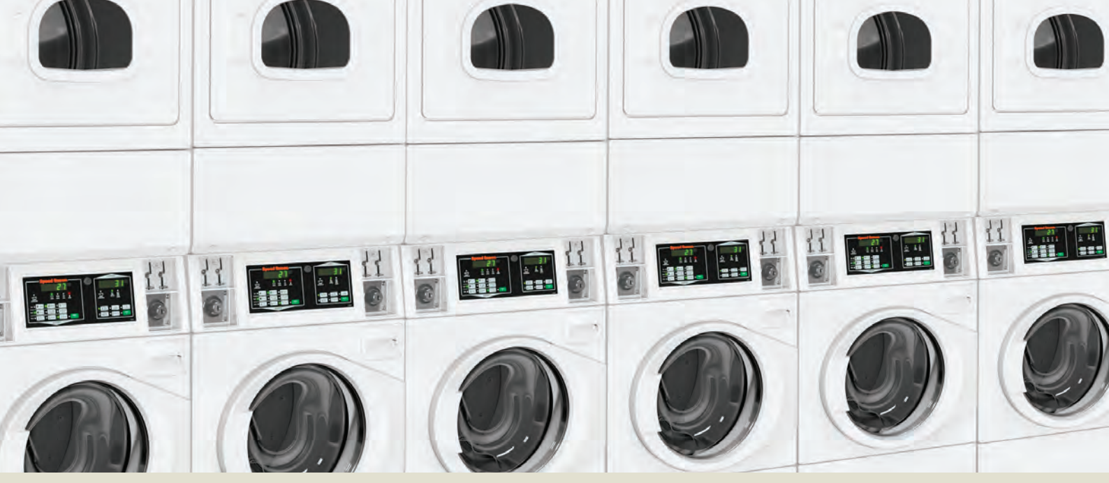
ACTIVATIONS SINGLE DROP • DUAL DROP • ELECTRONIC DROP • AFTERMARKET CARD READERS AND CENTRAL PAY

Available in 9.5 kg (21.5 lb) washer capacity and 8.0 kg (18 lb) dryer capacity.