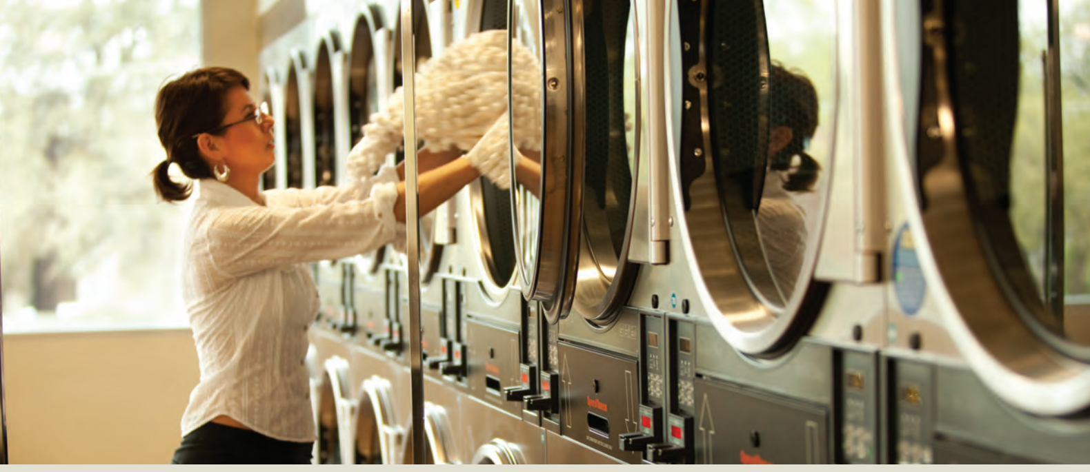
ACTIVATIONS SINGLE DROP • DUAL DROP • ELECTRONIC DROP • AFTERMARKET CARD READERS AND CENTRAL PAY Available in 13.6 kg (30 lb) and 20.4 kg (45 lb) capacities.