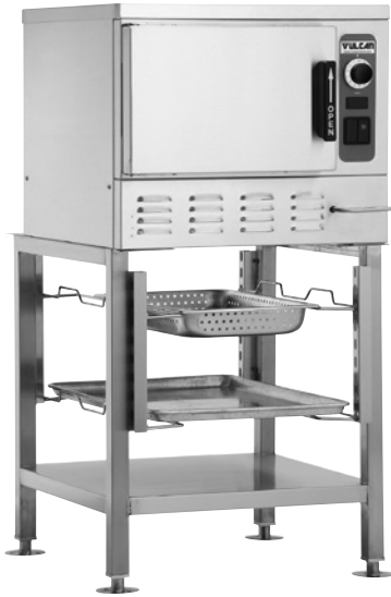
Shown on accessory stand with extra set of pan slides and pans